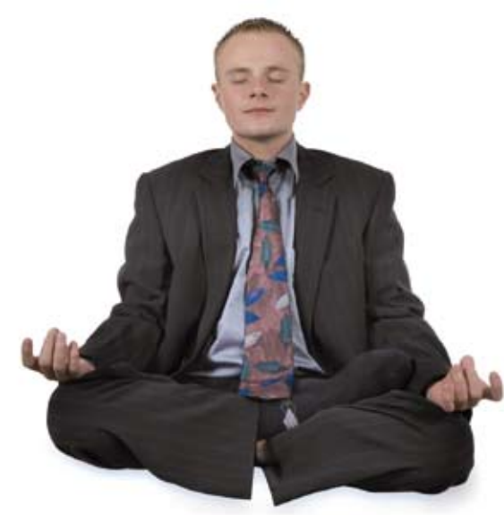
>>> Find out more at www.comundus.com